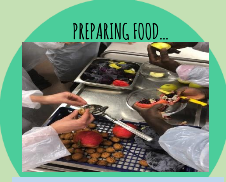
Photo from the Italian Healthnic Workshop by Diciannove in Luserna San Giovanni