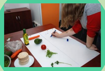
Photo from the Polish Healthnic Workshop by Danmar Computers in Rzeszow