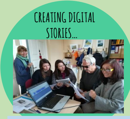
Photo from the Greek Healthnic Wokshop by Vardakeios School on Syros island

FOR MORE INFO VISIT HEALTHNIC.EU OR CONTACT US AT INFO@HEALTHNIC.EU